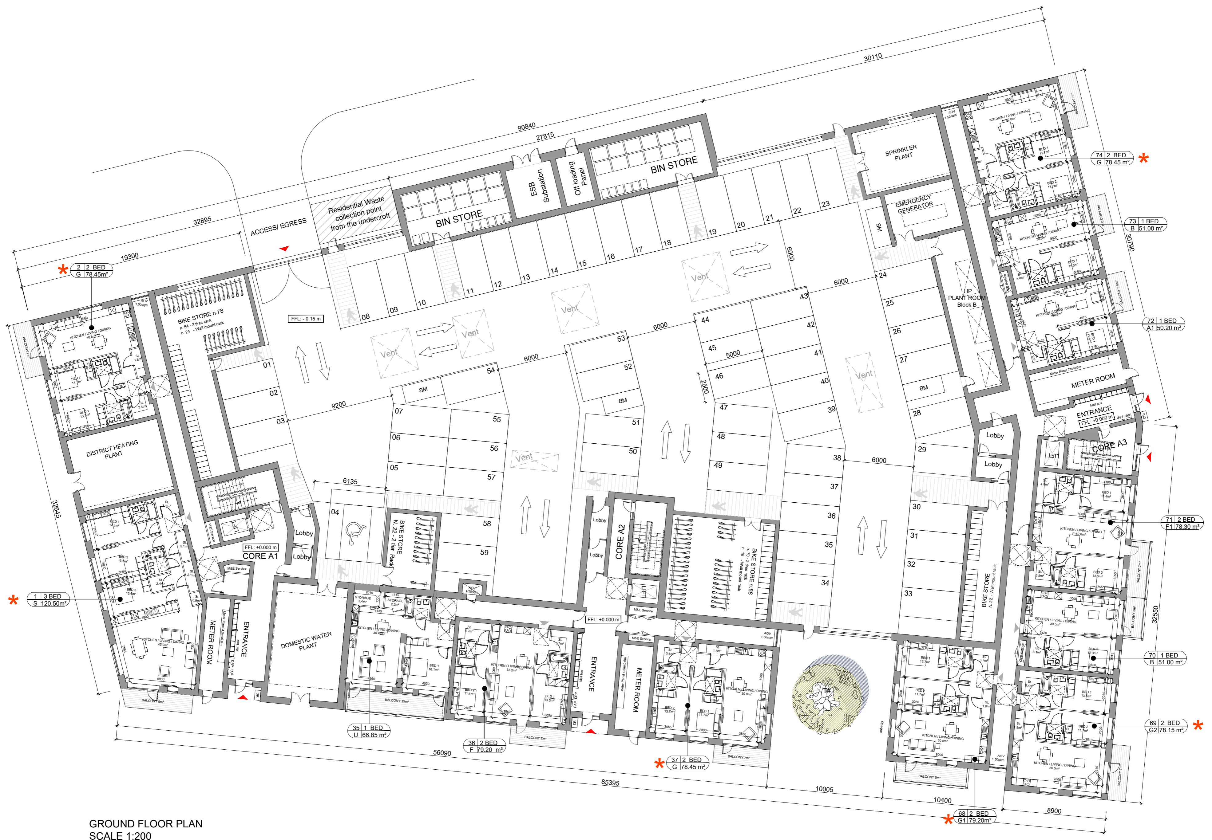
GROUND FLOOR PLAN SCALE 1:200